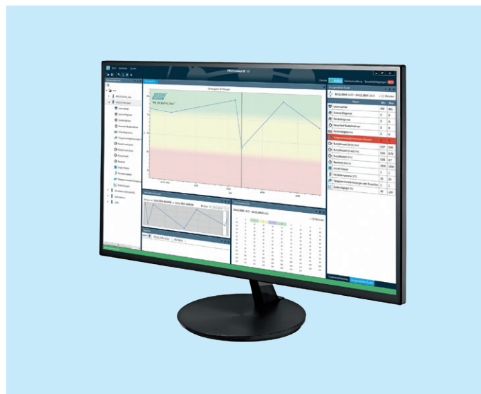
Network management software PROmanage® NT